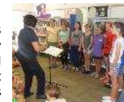
Choir performed at Assembly last week