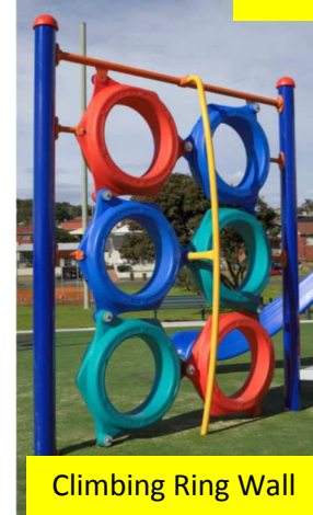
Climbing Ring Wall

Our new adventure playground will be installed in the next 4 to 6 weeks. Very exciting!