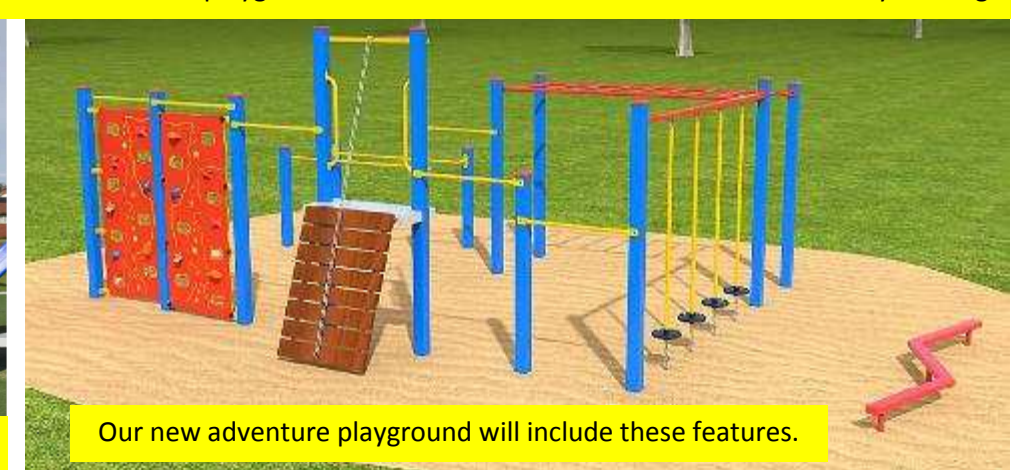
Our new adventure playground will include these features.