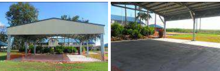
Our new Covered Area has a brand new concrete surface. It is already being put to use by students and staff. Thank-you, P&C.