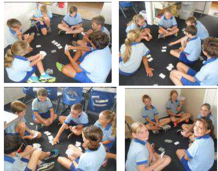
Some of the Year 5/6 students playing 'Numero'.

We are working on factors, multiples and divisibility rules. Every day, we are doing problem-solving. We have been playing a maths card game called 'Numero'.