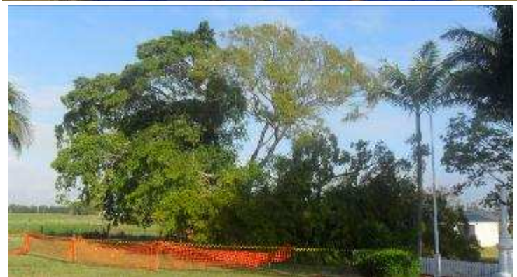
Damaged fig tree after the storm — It landed on the adventure playground.