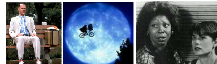
Name the Movie (movie scene). Answers over page.