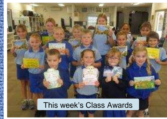
This week's Class Awards