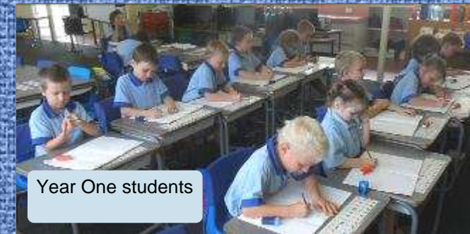
Year One students