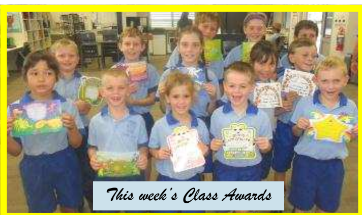
This week's Class Awards