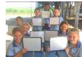
Student Leaders show off our new whiteboards

We have just received items from last year's Woolies Earn and Learn program. Our school ordered a number of classroom sets of mini whiteboards and accessories for students to use.