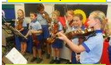
Our strings group performs